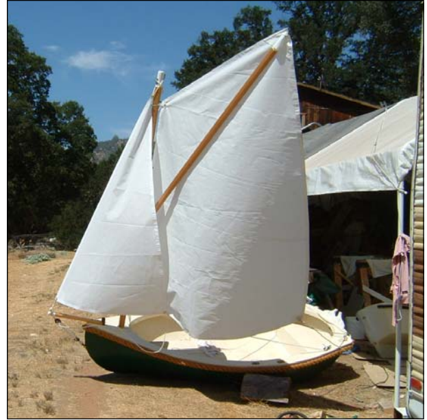
The completed Swallow/Amazon inspired dinghy.