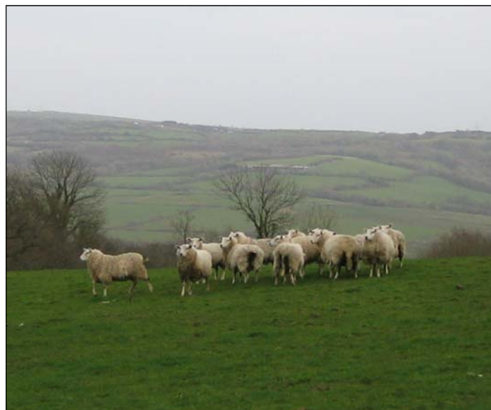
Sheep out to pasture at Tyr Eithin Farm in Wales.